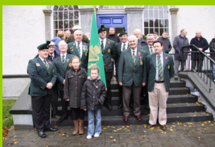
Committee members along with the young people who honoured us by laying the wreaths on Remembrance Sunday