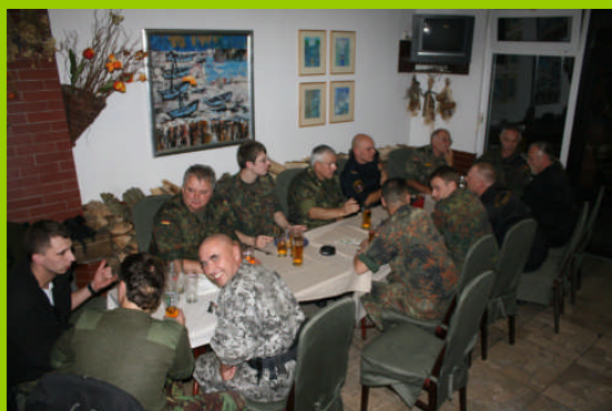
Fraternizing with the 'old enemy' in Posnan October 2008 Irish Style!

Glencree and to also mark the Irish dead at Glasnevin and the mistaken bombing raid at Duleek in 1941. The