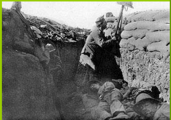
A soldier from the 10th Division of the Royal Irish Fusiliers Gallipoli 1915-16

Troy / Shopping in Cannakalae. Lunch out.