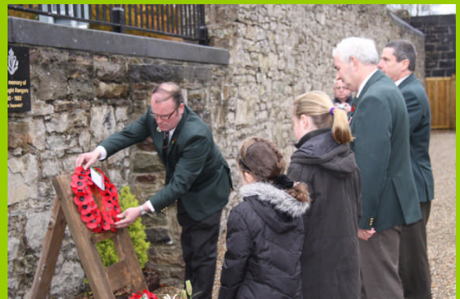
We did remember them at King House, both young and old in 2008